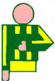
ILLEGAL FORWARD PASS