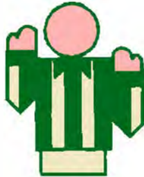
PASS JUGGLED INBOUNDS CAUGHT OUT OF BOUNDS