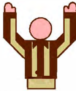
TOUCHDOWN, FIELD GOAL OR SUCCESSFUL TRY