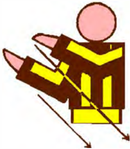
INTENTIONAL GROUNDING OF PASS