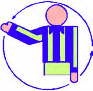
NO TIME OUT, OR TIME IN WITH WHISTLE