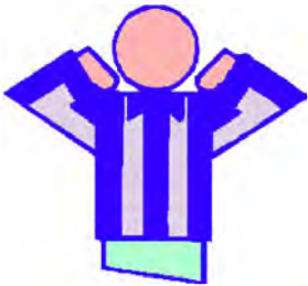
BALL ILLEGALLY TOUCHED, KICKED, OR BATTED