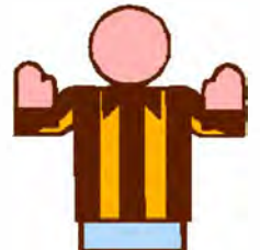
INTERFERENCE WITH FORWARD PASS OR FAIR CATCH