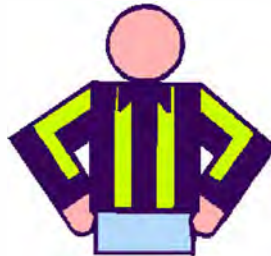
OFFSIDE OR ENCROACHING