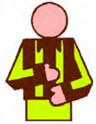
ILLEGAL PROCEDURE ILLEGAL FORMATION ILLEGAL SHIFT