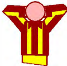
LOSS OF DOWN